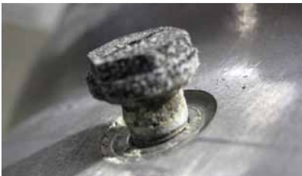
Oxidation starting below nut .

One of the main reasons for valve holes cracks is due to corrosion around the valve and the valve hole. With some simple and quick maintenance actions, this corrosion can be eliminated.