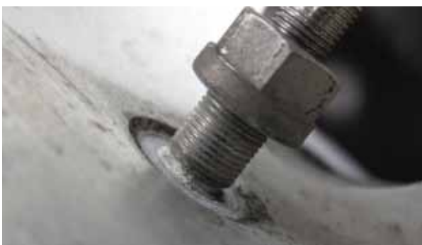
Oxidation on T shape grommet .